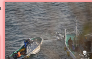
Dolphins still alive