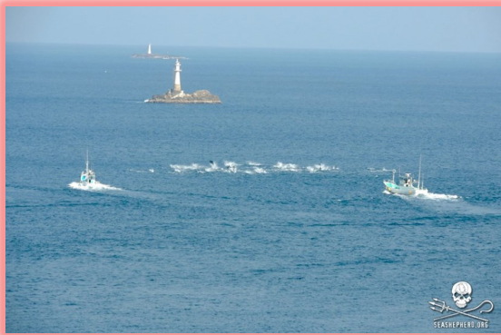
Dolphins being driven back to sea