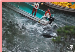
Dolphins run over