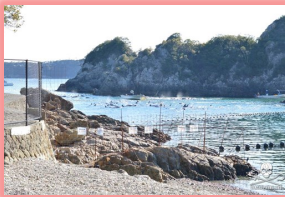
Dolphins in Cove