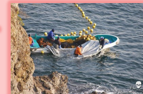
Hiding their deeds