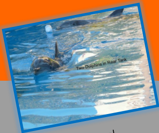
Dolphins in Rear Pool

BEETLE; big head. Flower shaped pox on his right side.