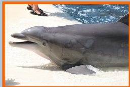
Skin Issues due to stress