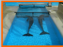
Dolphins at Gate-Bored