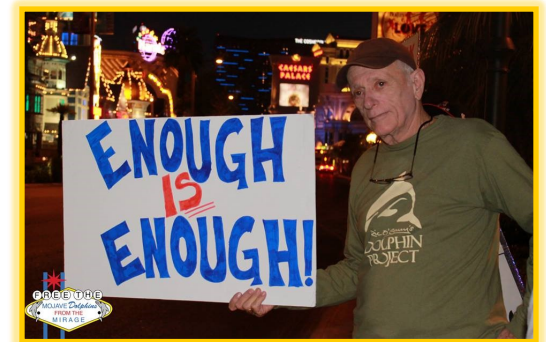
Richard O'Barry-Dolphin Project-The Cove