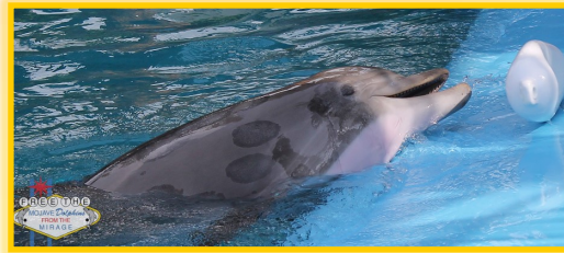
Maverick-Poxvirus (Pic Taken August 2014)

Poxvirus is a disease that forms skin lesions on dolphins. It has been observed in both free-ranging and captive bottlenose dolphins. The large patches are made up of smaller spots. The color and size can change rapidly. The disease occurs frequently in captive dolphins and is endemic in some colonies. Poxvirus is not contagious to humans like the pinniped version of the disease. In captivity, there appears to be a correlation between pox-like lesions and stress, environmental conditions, and the overall health of the animal. Poxvirus is not immunosuppressive unlike the cetacean morbillivirus.