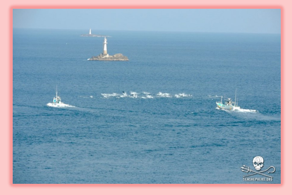
Dolphins being driven back to sea